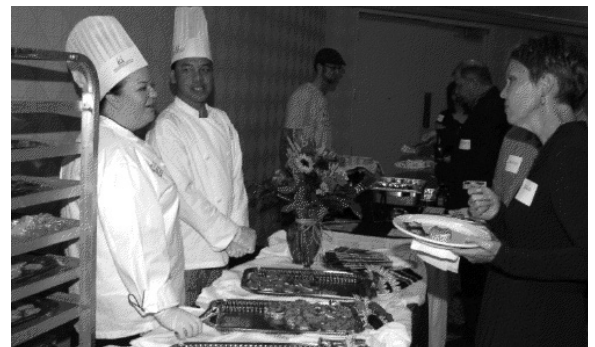
Ames Education Foundation TASTE for Education. Attendees sampling cuisine from wonderful chefs and restaurants.