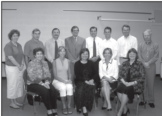
Ames Education Foundation Board of Trustees 2006-2007

For more information on how you can provide support to the Ames Education Foundation, contact the office below.