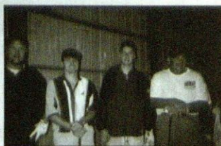
Second Flight winners