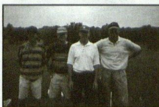
First Flight winners