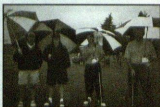
Championship Flight winners